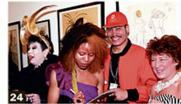
April 3: The Society of Illustrators held a reception for its exhibition "The Line of Fashion." It was a benefit to support the Gay Men's Health Crisis, a nonprofit group dedicated to the fight against AIDS. The exhibition, at 128 East 63rd Street, runs through May 2.