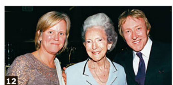
April 7: Trickle Up celebrated its 30th anniversary with a dinner at the Rainbow Room. It was attended by 336 guests.