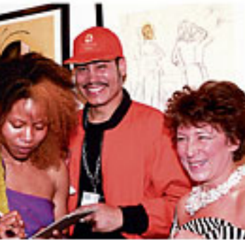
April 7: The Glimmerglass Opera held a benefit at the Metropolitan Club to raise money for the Young American Artists Program.