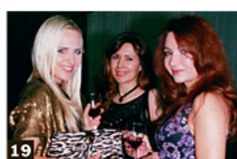
April 9: The International Auto Show held a gala at the Javits Convention Center. The evening benefited East Side House Settlement.