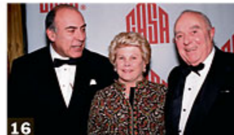
April 7: The National Center on Addiction and Substance Abuse at Columbia University held its annual awards dinner at the Pierre. It was attended by 350 guests.